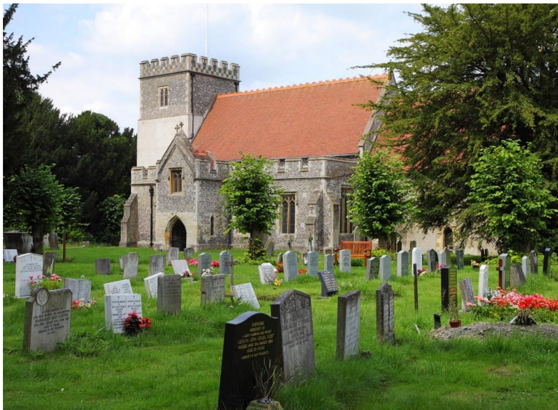
St. Michael's Churchyard, Aston Clinton

St. Michael's Churchyard, Aston Clinton, Buckinghamshire contains 4 War Graves – 3 from World War 1 and 1 from World War 2.