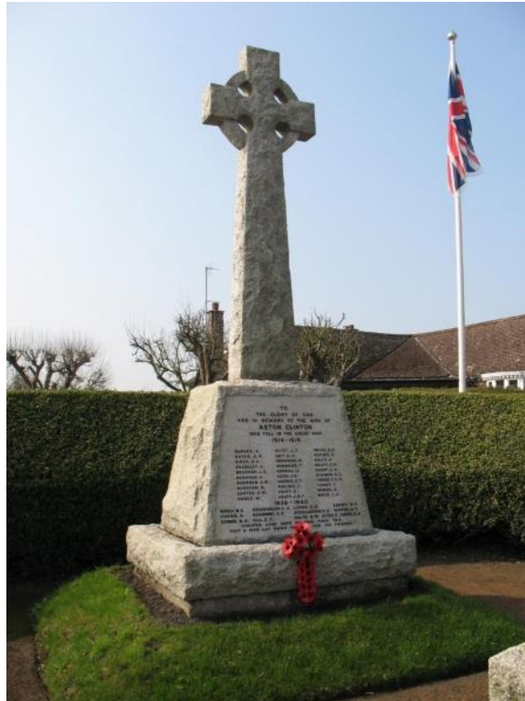
Aston Clinton War Memorial